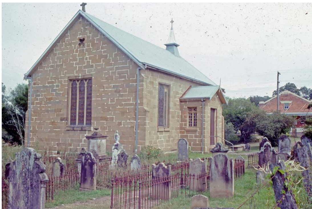
St Paul's at Paterson