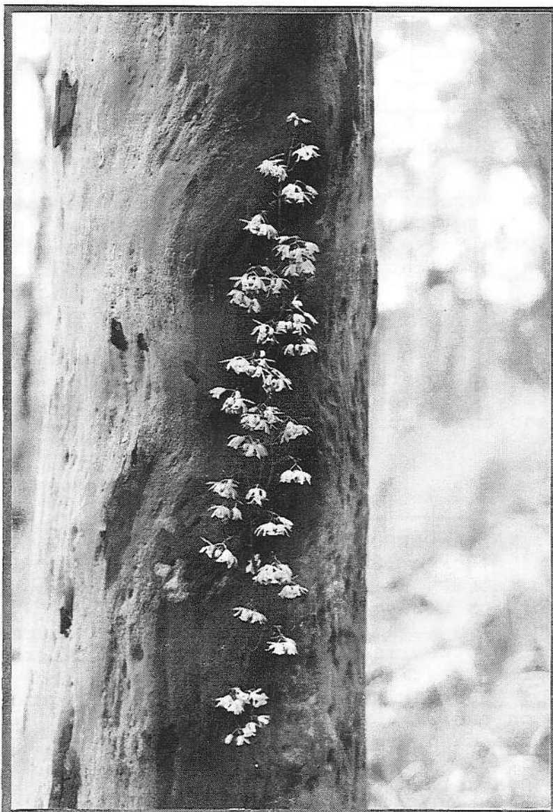
Galeola cassythoides (Climbing leafless orchid)