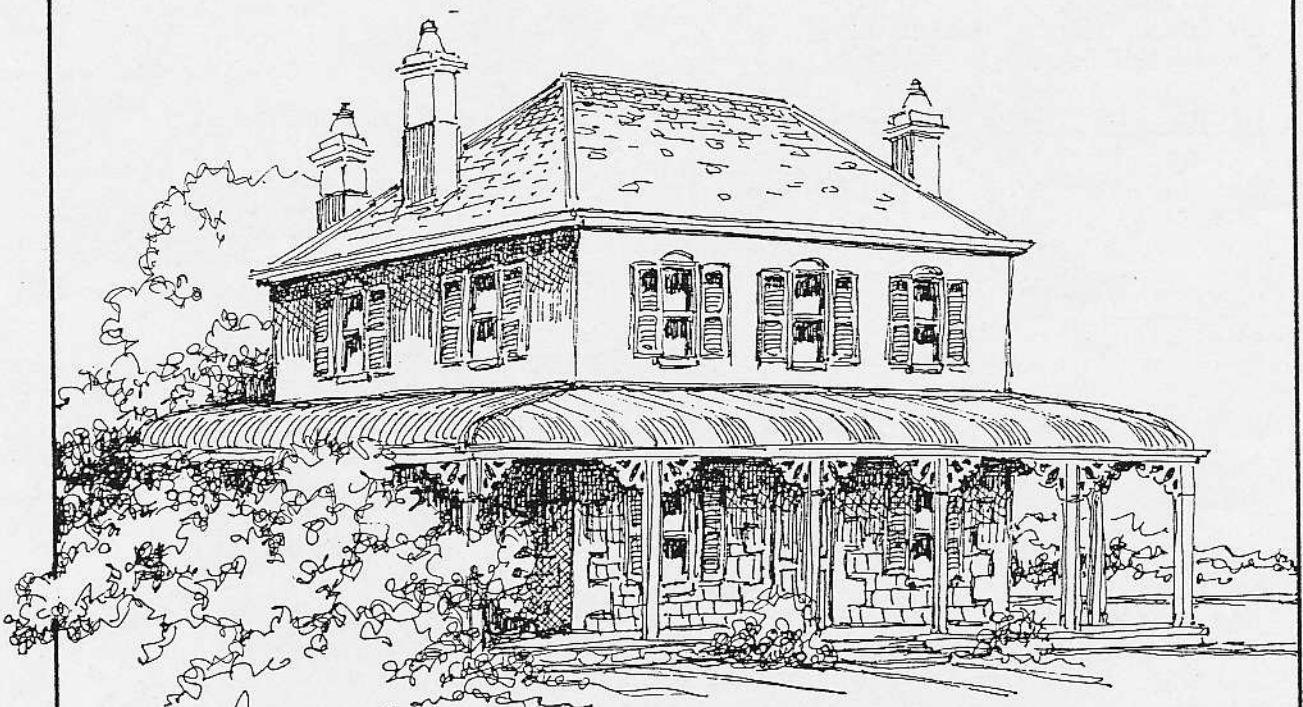
"ANNANDALE" - 1839 PATERSON - NSW